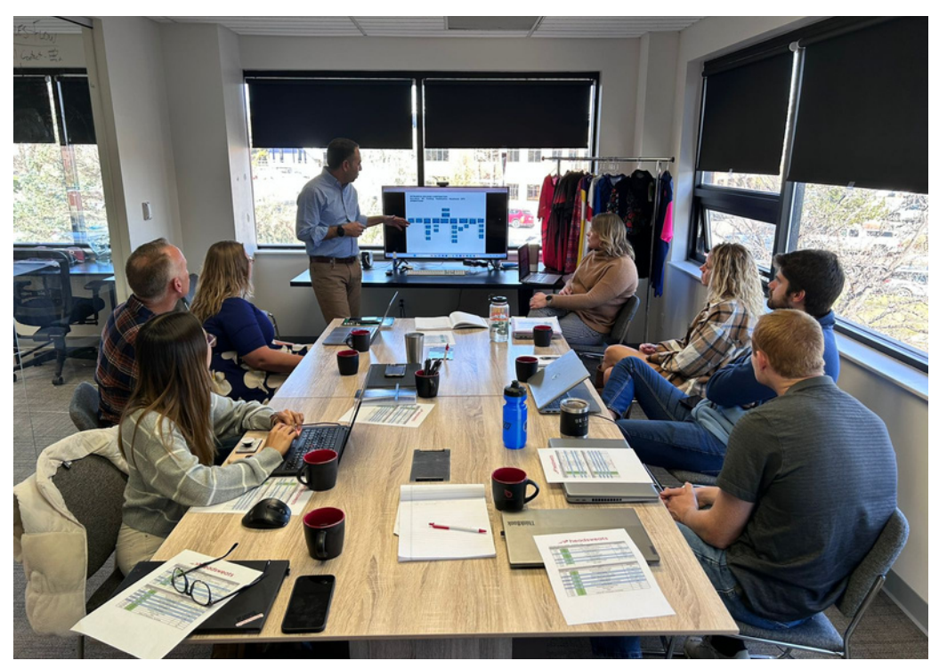
Headswets Team Summit 2023, Boulder office

We are so proud to be a leader in performance wear and it shows! We are a diverse group of athletes designing the best, most technical gear and proud of it. We are here to help you in every step of the way, whether creating a fully custom piece or a single hat on our website. Give us a shout!