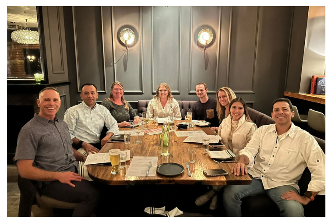
Headsweats 25th Anniversary Team Dinner